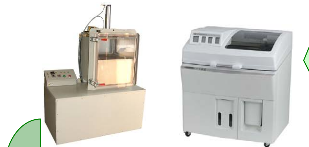
xlaFORM INFUSER ZCORP 3D PRINTER