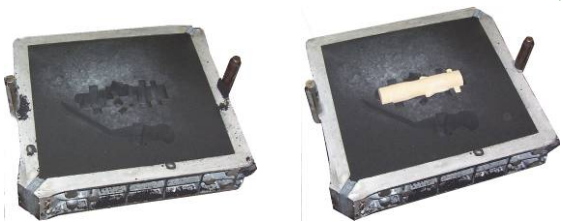
SAND MOLD & CORE SET